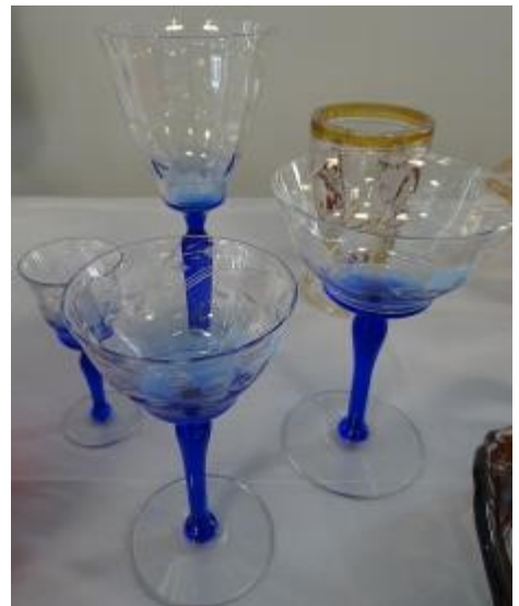
The enigma of the optical-illusion blue stems. Just where does that color end? Who made them? And how?