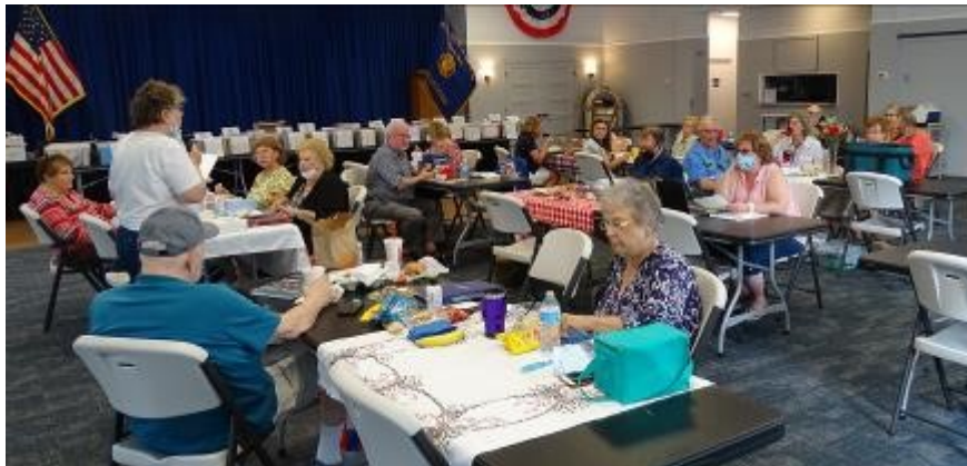
The room looked fantastic and so did the people and glass in it