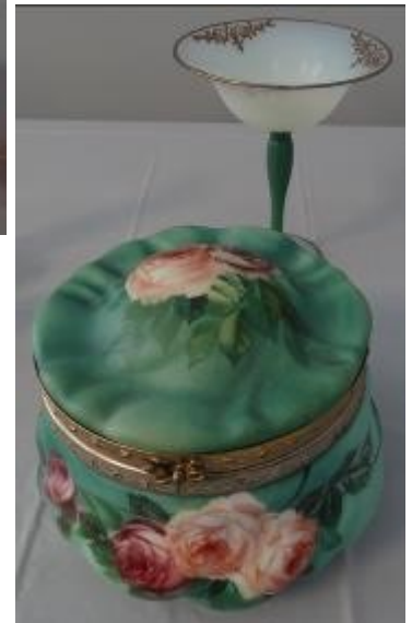
Wave Crest by C.F. Monroe and Fry Foval and Jade comport. How elegant can we get?