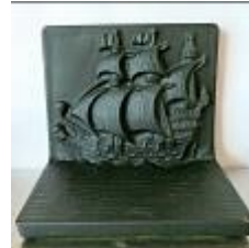
Tiffin Clipper Ship