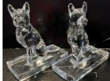
New Martinsville German Shephards