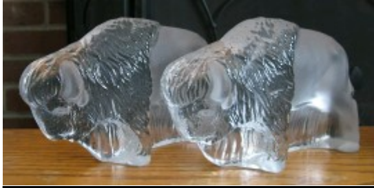
Dalzell Viking Buffalo/Bison