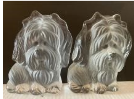
Viking Yorkie/Shi Tzu