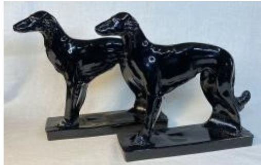
New Martinsville Viking Wolfhound/Borzoi