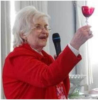
Bette gets lost in the joy of beautiful red glass