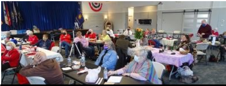
A wonderful meeting full of wonderful people.