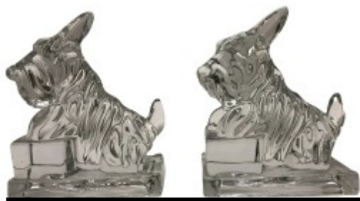
Cambridge Scottish Terrier