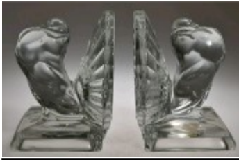
Cambridge Pouter Pidgeon