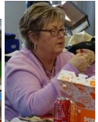
Popeyes was the popular lunch of the day. Chicken nostalgia?