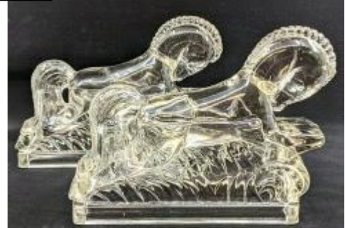
L.E. Smith jumpers