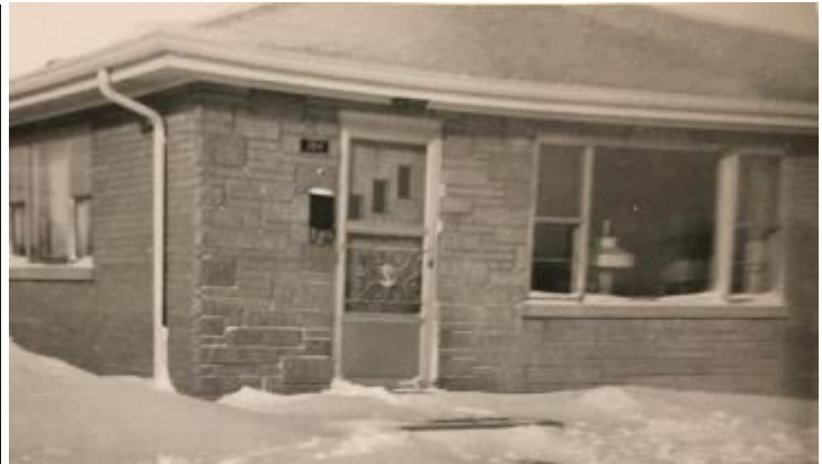
On a cold and snowy day in the 1950s, Loretta's fanciful lamp sits in the front window and sheds light and cheer on the neighborhood.

In the photo at left, both "Bali Dancer" lamps can be seen with the original shades. A variation is shown on the right.