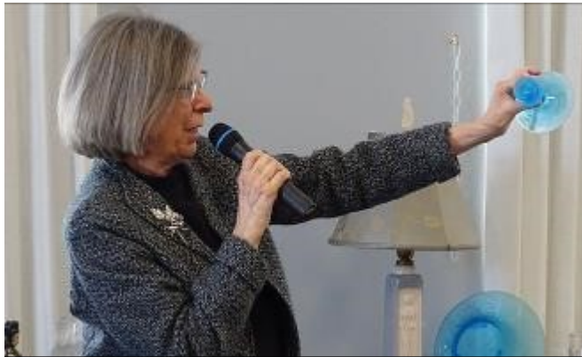
Mary wonders if she still loves her Cupid Brocade. Yes, of course she does!