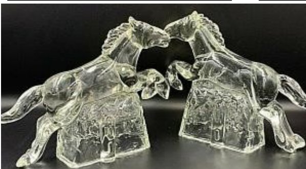
Unidentified—but aren’t they wonderful?