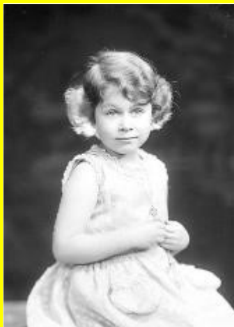
H.R.H. Princess Elizabeth circa 1931