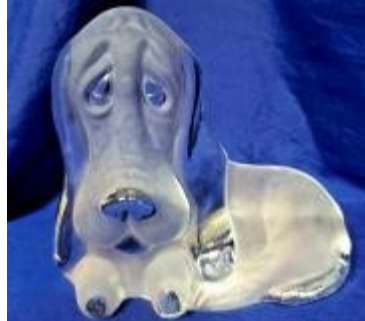
Viking Bassett Hound