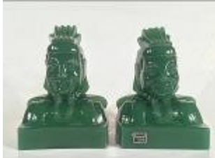
Imperial Lenox Cathay