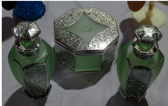
The editor doesn't use perfume or powder, but could find something to put in this heavenly glass!