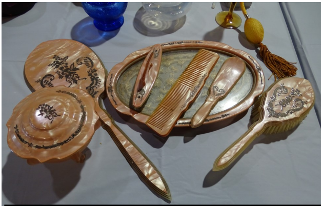
Beautiful things that made one beautiful.