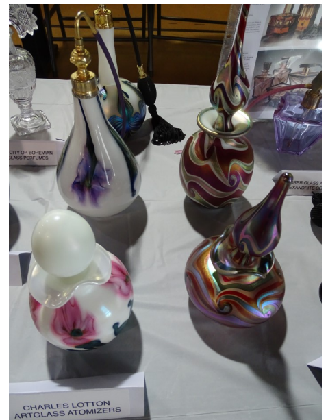
A beautiful array of perfume bottles