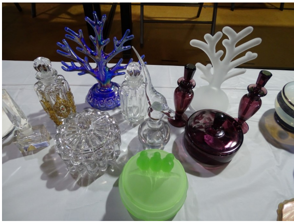
Our members supplied an enormous amount of vanity glass. A treat to the nose and eyes as well.