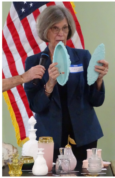
Left: the cleverly designed Fostoria Crown perfume bottle/candle holder makes it's 3rd appearance in The Society Page! Right: Fostoria's Jenny Lind glove box could also be used as cymbals ... but only once.