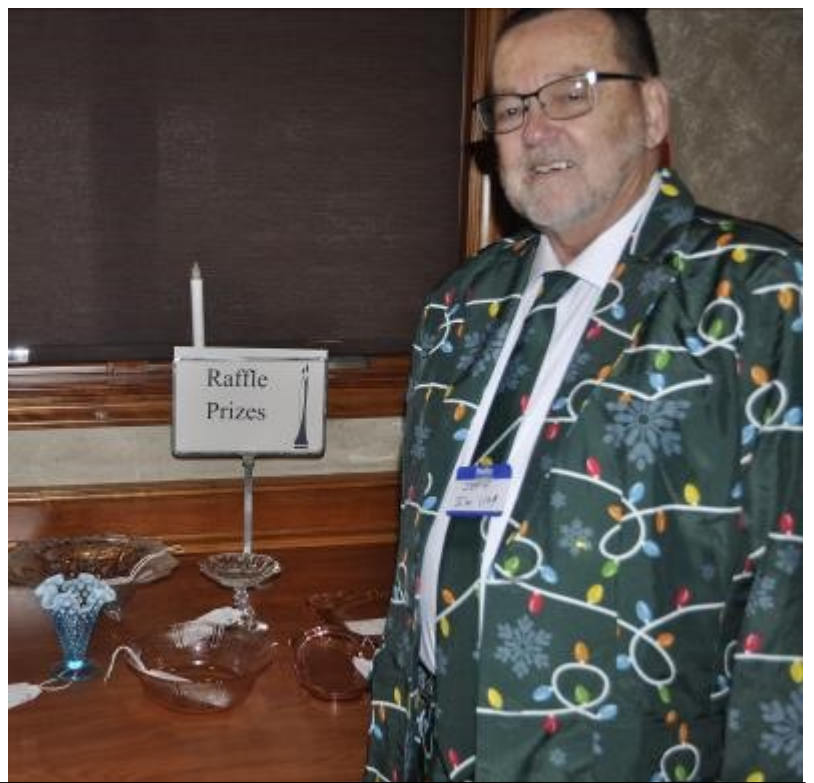
Dudes bringing the holiday spirit!