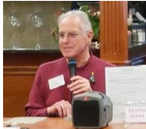
2) Listen to Der Bingomeister for the numbers